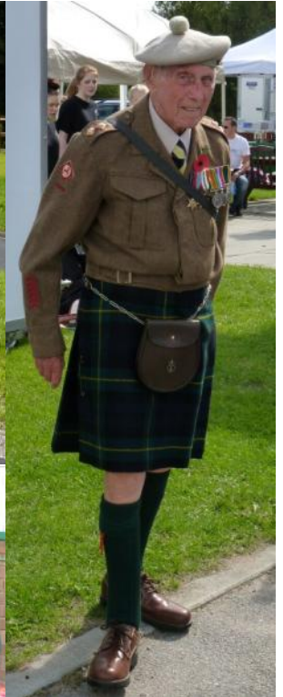
Get chore luvverly balloon race tickets 'ere