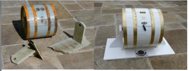
The tomboola drum is out of intensive care and ready for use