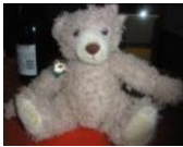
Baxter Bear travels with our DG