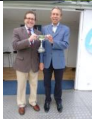
A good day was had by all