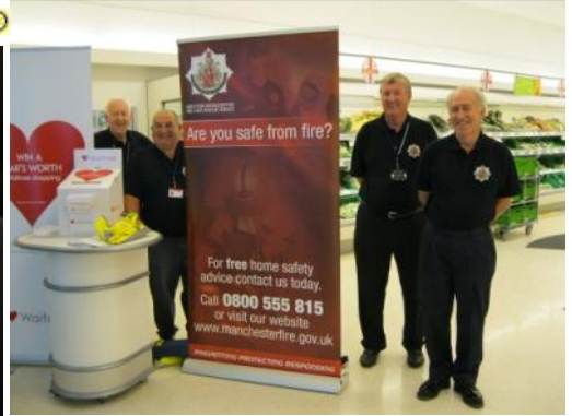
Our fire team doing their great work