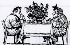
INDOOR PLANTS CAN DO MUCH TO IMPROVE THE VISUAL APPEARANCE OF YOUR ROOMS .....