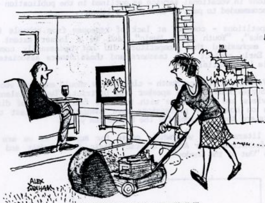
"Nick Faldo's just had another birdie!"

Water Aid : continuing Rotary's efforts in this field, a video and slides were shown and which are available for clubs to borrow. This year District is targeting one particular area in Tanzania and would be pleased to receive funds.