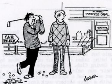
"You've hit that Ford Sierra again!"