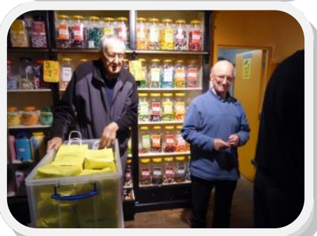
Members gathered at Sweet Thought to pack the bags for Santa's float.

A night at CHADs theatre to see 'No Sex Please, We're British'