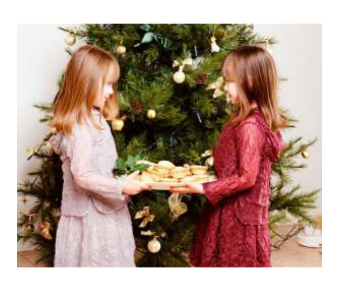
A very Happy Christmas to all!