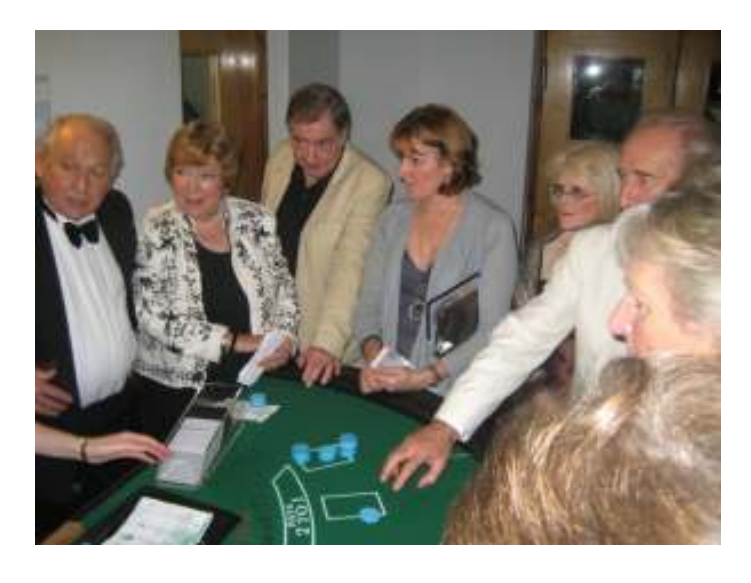
Gambling on Charter Night! Where's Bond?