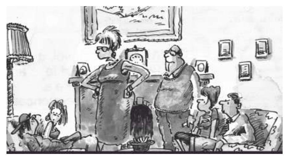
'Doing charades is a tradition in this family, young man, and 'Fat bloke being stupid' is not the kind of answer we're used to.'