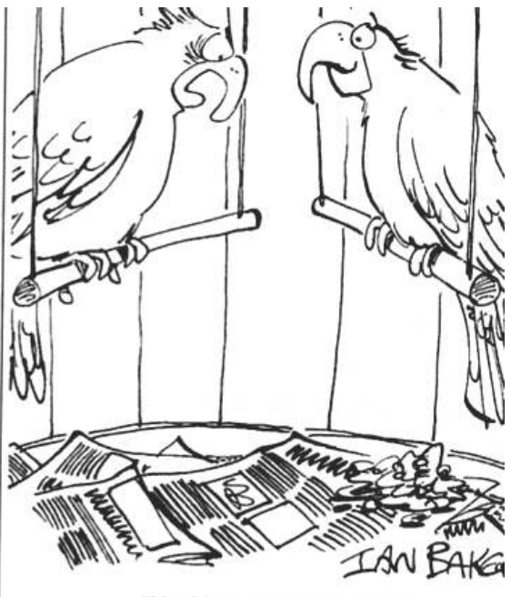
"Hey! I was reading that!"