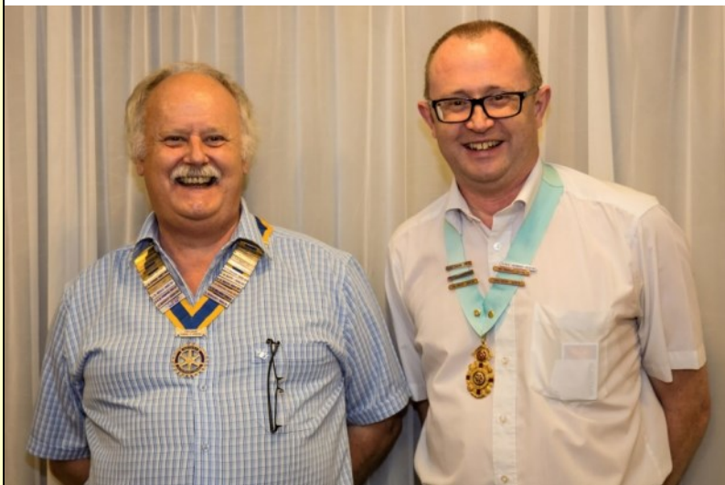
The new DG checked up on the new President