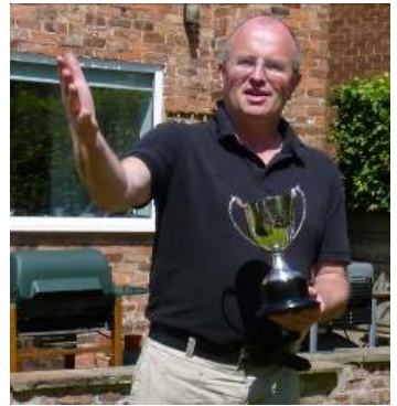
Sold to the gentleman over there with the camera