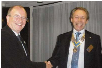
Our 25th President takes office