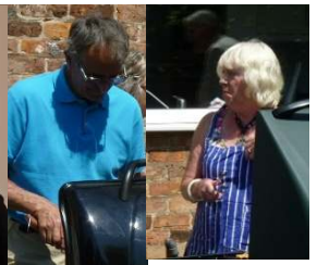
The barbecue chefs

Meeting apologies to apologies@bwrotary.org.uk by Tuesday noon please Website: www.bwrotary.org.uk