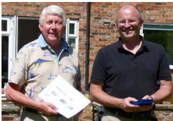
Certificates at the Barbecue