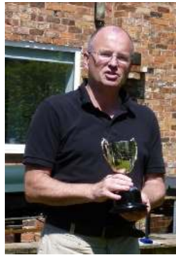
What am I bid for this shiny cup?