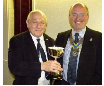
Handing over the Mercian cup